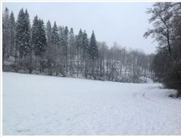
Snowy Herefordshire valley, basic topographic survey carried out.

Well its been a very busy January with scour protection surveys, topographic surveys and measured building surveys. The snowy weather meant we had to postpone a couple of things but for the most part surveys continued, with some beautiful cold days in a Herefordshire valley and water course survey in Shrewsbury. February is all but fully booked and with some good quotes also out there.