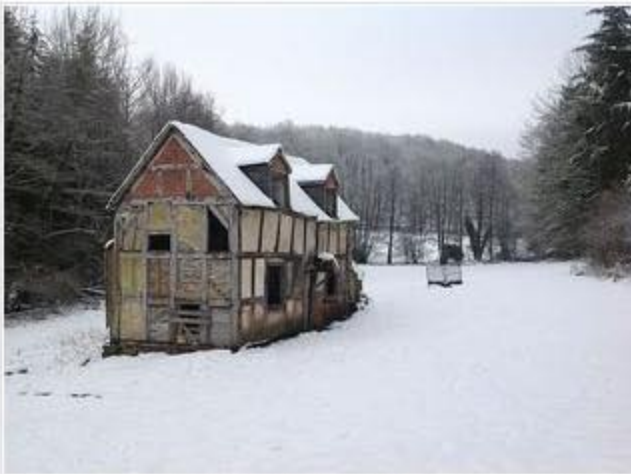
We carried out a laser scan of this timber cottage inside and out. Not during the snow though!

Well its been a very busy January with scour protection surveys, topographic surveys and measured building surveys. The snowy weather meant we had to postpone a couple of things but for the most part surveys continued, with some beautiful cold days in a Herefordshire valley and water course survey in Shrewsbury. February is all but fully booked and with some good quotes also out there.