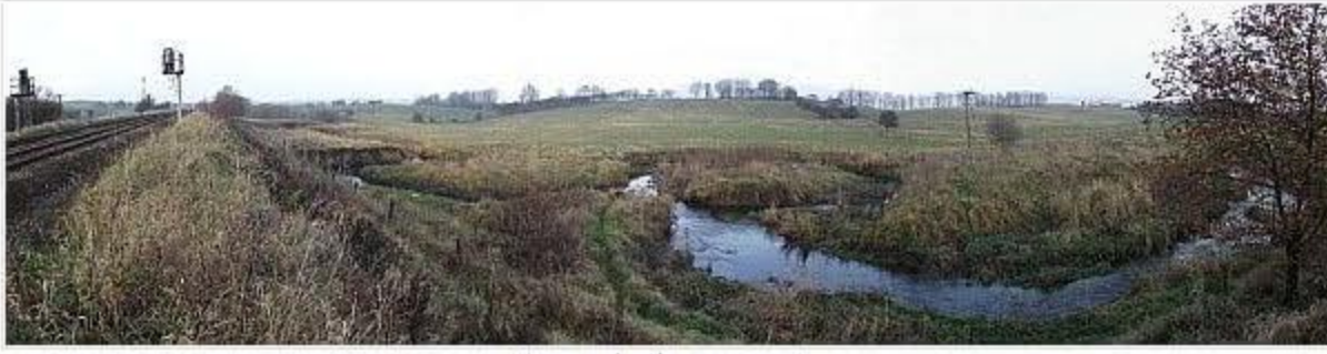
River and railway surveying

Last week saw us carry out surveys at both ends of the spectrum. Firstly a topographic survey of both river and railway environments in the North of England at the front end of the week. The survey is to aid the design of protection to the embankment from scouring out by the river.