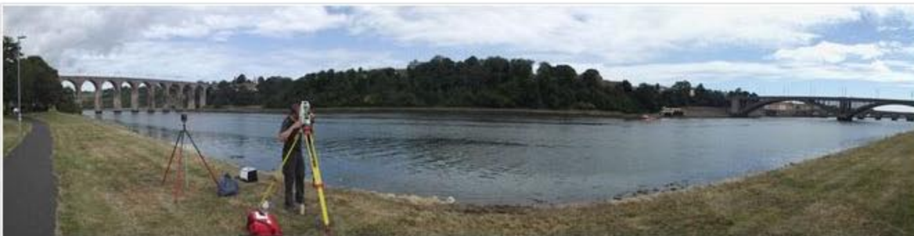
Watercourse survey of the river Tweed, 250m wide with some big bridges. The boat crew is just below the bank.