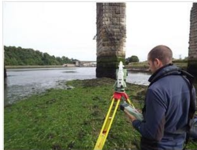
Surveying the viaduct at low tide