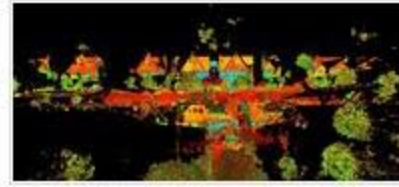
Semi-detached house, captures a good deal of the street scene also