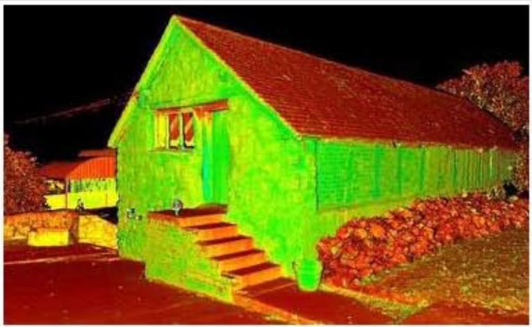
Barn laser scan

Following a recent trip to Holland John has been processing approximately 90 scanworlds collected with a Leica 7000 Laser scanner. The scan data will be utilised to enable the final design of conveyor systems.