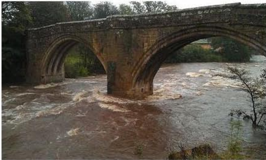
Devils Bridge, River Lune at Kirkby Lonsdale in flood. not one of our survey sites! 3d model.

It seems the poor summer is extending into Autumn with rain crossing the country every other day if not more frequently. This has caused us some problems over the last week with two of our scour protection river sites subject to rapidly rising water levels. Managed to complete one this week with another on hold until dry weather (hopefully!) results in what would normally be knee deep levels. On the plus side we have been laser scanning a warehouse/factory in Holland to provide 2d floorplans and