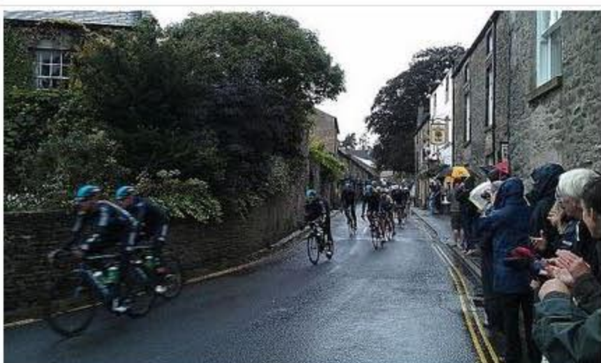
Team Sky coming through Kirkby Lonsdale on the Tour Of Britain