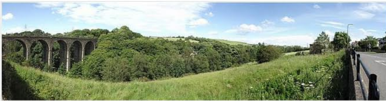
Finally a beautiful summers day!

At last, after an appalling summer, we have had a beautiful days surveying on the River Don. Survey was part of a series of surveys to enable design of scour protection on some of the countries at risk railway bridges. So far this month we have carried out 3 basic scour protection surveys and 2 detailed, a further detailed to start next Monday.