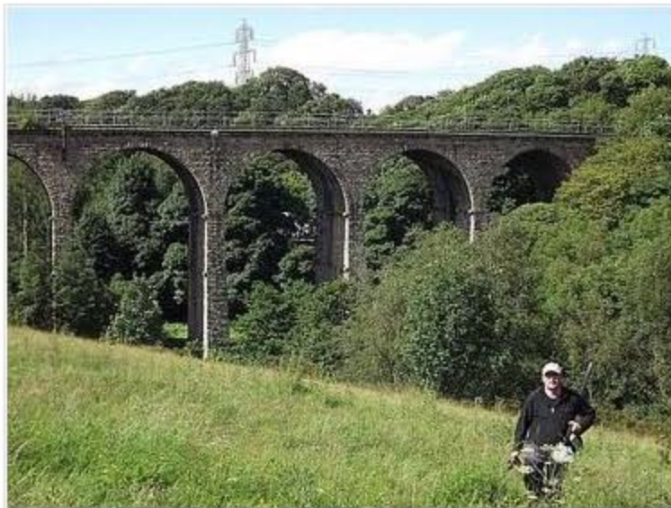
On way to establish control above the viaduct.

At last, after an appalling summer, we have had a beautiful days surveying on the River Don. Survey was part of a series of surveys to enable design of scour protection on some of the countries at risk railway bridges. So far this month we have carried out 3 basic scour protection surveys and 2 detailed, a further detailed to start next Monday.