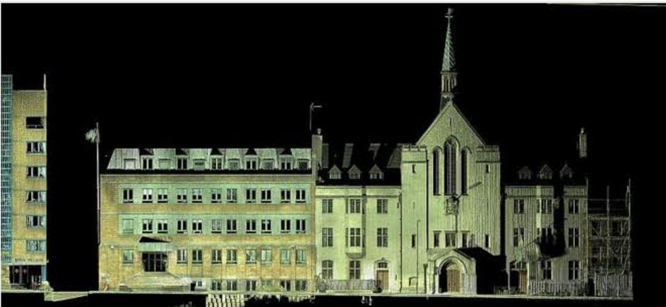
Another orthographic street elevation, this time with true RGB colours captured with the C10's onboard camera.