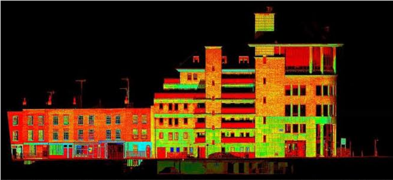
Fully scalable orthographic image. Once the point cloud data has been captured and registered, images like this can be quickly exported. Can this replace your standard 2d line work elevation drawing?

build up a 3d model within Archicad. Archicad does not currently support point cloud data in its native form, however fully scalable high resolution images of the point cloud can be imported and used within Archicad. The images shown have been reduced in size for the web, if you would like to see some full resolution images please contact us.