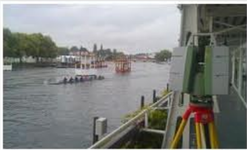
Laser scanning a Henley-on-Thames Pavilion.

Yesterday we carried out a 3d laser scan of a pavilion at Henley-on-Thames. the survey is to provide elevation drawings. Not exactly the best day for scanning!