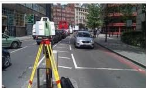
Laser scanning in central London

Following a successful presentation to the Stroud Building Design Association we have been asked to carry out a laser scan in central London to provide Rights of Light elevation drawings. Projects completed in the last month or so include, a railway and watercourse survey, various topographic surveys and a levelling exercise to add floor heights to existing floor plan drawings. Up coming work includes measured building survey of a local barn, laser scan of a pavilion in Henley on Thames and topographic survey on a technology park.