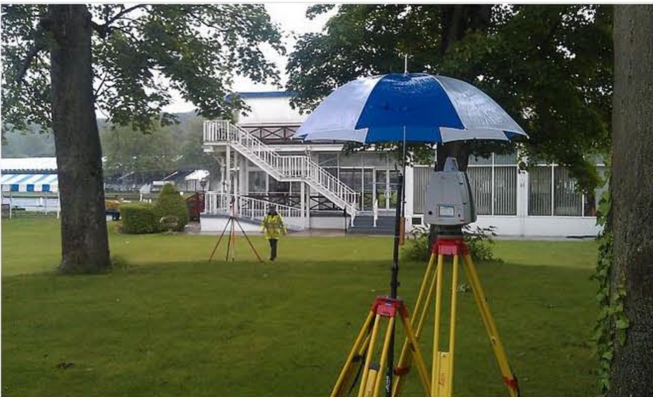
Keeping the scanner dry on a summers day!

Yesterday we carried out a 3d laser scan of a pavilion at Henley-on-Thames. the survey is to provide elevation drawings. Not exactly the best day for scanning!