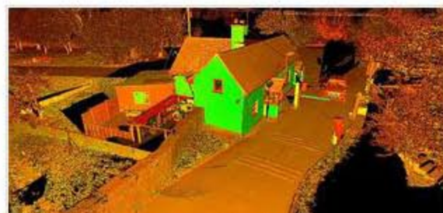
Point cloud data captured for elevations and building floor plans