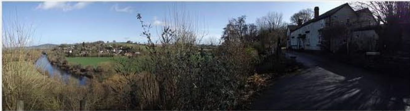
Saturday morning laser scanning a former inn overlooking the River Wye. Views like this make surveying worth while!

Following a number of rail and river surveys in the north of England we have been lucky enough to change tack and survey a variety of properties in the Hereford and Shropshire area. Properties recently surveyed include a pool building in Ludlow, former Inn overlooking the River Wye and interestingly a timber toll bridge house.