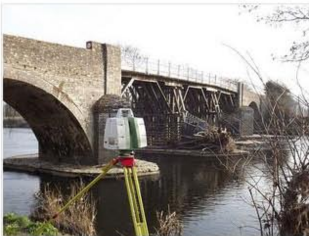
Leica C10 in action

We have recently completed a topographic and measured building survey of the Toll House at Whitney-on-Wye's famous toll bridge. The Whitney-on-Wye bridge was built in 1797 by an Act of Parliament that also exempts the toll income from tax. Again another wonderful place to have the privilege of surveying. We used the Leica C10 laser scanner to capture the elevations and external footprints for the floor plan drawings.