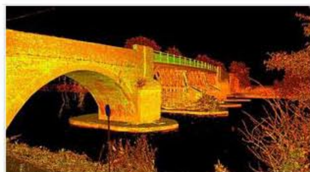
Whitney Toll Bridge captured using Leica C10 laser scanner